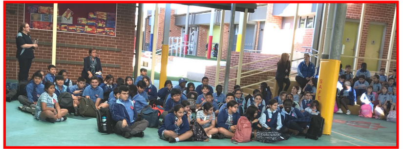
ANZAC Day Assembly 2021