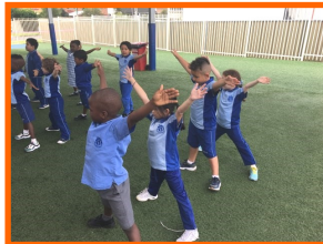
Dance Fever Gymnastics Program Year 1