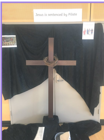
Holy Week Displays